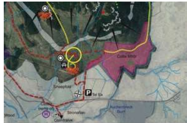
Access. Orientation. Topography. Management.