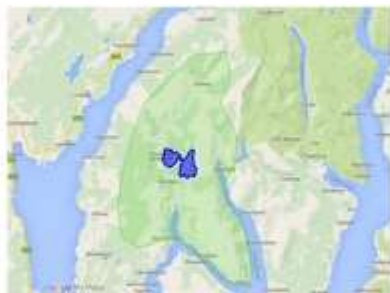
Location, Extent and Forest in ColGlen 28 miles top to bottom. Pop. 350-ish. Demographic mix

CGDT undertakes various projects, including the upgrade and promotion of The Cowal Way and its aspiration to be one of Scotland's Great Trails, and the purchase in 2013 of over 600 hectares of Stronafian Community Forest , so Col-Glen has a lot to offer and the Development Trust are keen to explore hutting as a means to increase visitor numbers by providing infrastructure and facilities to allow more people to access the landscape and explore and enjoy the local area.